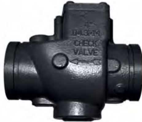
Tech Data: G350

The valves are furnished with grooved ends and can be installed using grooved couplings. The Model 590 can be installed with ANSI class 150 Flanges utilizing our Figure 71 flange adapters and also ANSI class 300 Flange Adapters. All Model 590 Check Valves have been designed with a removable cover for ease of field maintenance. They may be installed in either horizontal or vertical piping systems with the flow in the upward or downward direction.