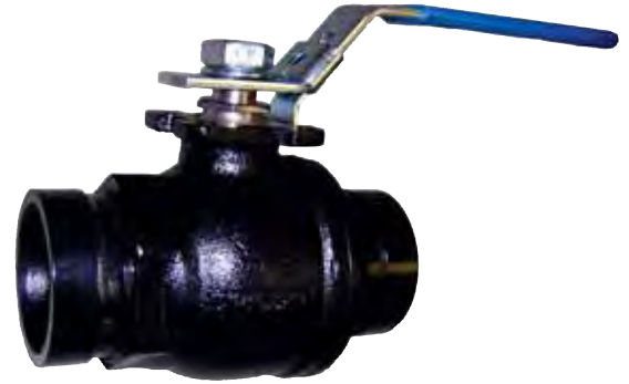
Tech Data: G380

The Model BV835 Ball Valve is capable of a working pressure of 1,000 P.S.I. in sizes 2", 2 1/2", and 3". Flow may be from either direction and the valves may be positioned in any orientation. The Model BV835 is furnished with grooved ends and features a handle that accepts a padlock device for locking in either the open or closed position.